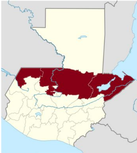
In red , the Northern Transversal Strip.

private ones of part of the political and military elite (Sabino, 2008).